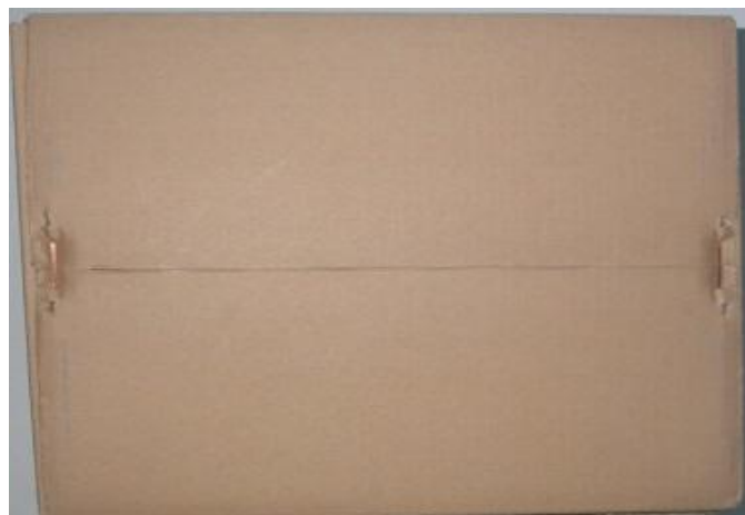
Fig.1- Tube pack for JA005